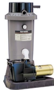
EC75A with Super Pump

The Perflex® Filter is available in multiple sizes and in a compact system in combination with the EC65BLP platform and a Hayward pump.