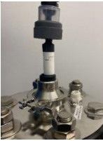
Quick-disconnect sleeve for easy maintenance

Sentry AquaGuard UV (SAG) systems feature a patent pending quick disconnect sleeve assembly for the easiest quartz sleeve removal in the industry. This unique design allows the operator to remove the sleeves in less