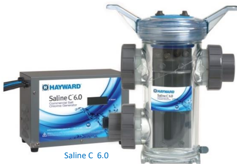
Saline C 6.0

Hayward Saline C® Series NSF certified salt chlorine generators are designed to produce up to 11 lbs. of chlorine per day.