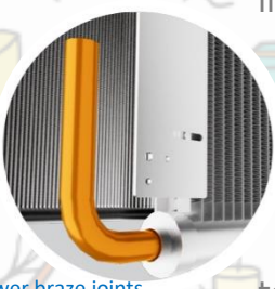
85% fewer braze joints