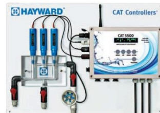
CAT 5500 Pro Package

The Saline C 6.0 and Saline C 11.0 when installed with the CAT 5500® become an advanced automated water quality solution.