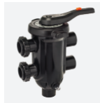
SP0425-SelectaFlo™ High-Efficiency Valve

A heavy-duty, tamper-proof, one-piece clamp provides quick access to internal components without disturbing plumbing connections.