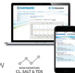
NOW MONITORS CL, SALT & TDS READINGS

Connect with PoolComm® to enjoy effortless remote monitoring (now including conductivity/NaCl) and audit tracking.