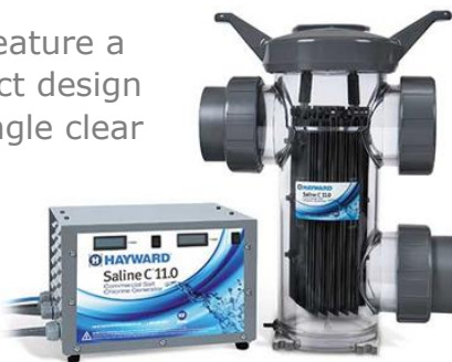
Saline C 11.0

This more efficient design lowers installation costs and consumes less space.